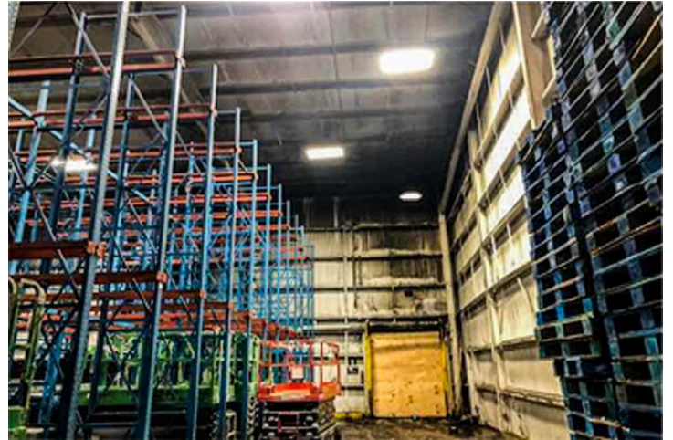
Contaminated Facility, Racks & Conveyors