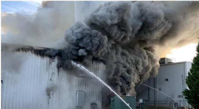
Firefighters from Oconee County Fire Rescue, Clarke County Fire Rescue and Barrow County Fire Department helped battle the blaze at Benson's Bakery Monday.