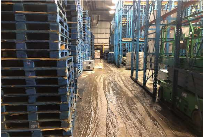
Contaminated Facility, Pallets & Baskets