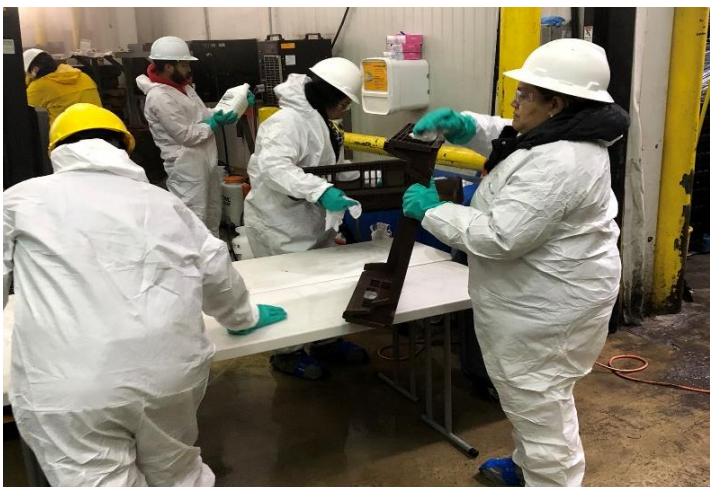
Crew at Cleaning Stations Cleaning Food Storage Baskets