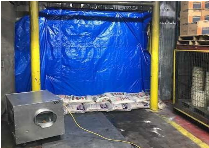
Temporary Wall Structure, Sandbags & HEPA Air Filtration