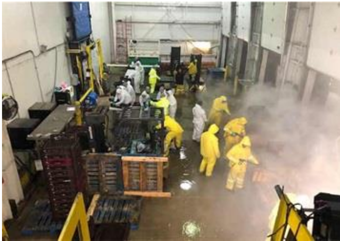
Crew at Decontamination Stations