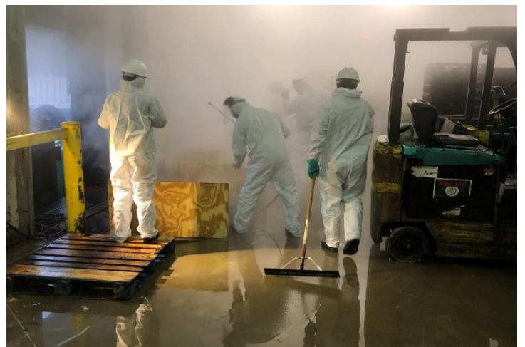
Challenging Environment (1 of 6 Decontamination Stations)

Full Circle Restoration & Construction Services, Inc. 4325 River Green Pkwy, Duluth, GA 30096