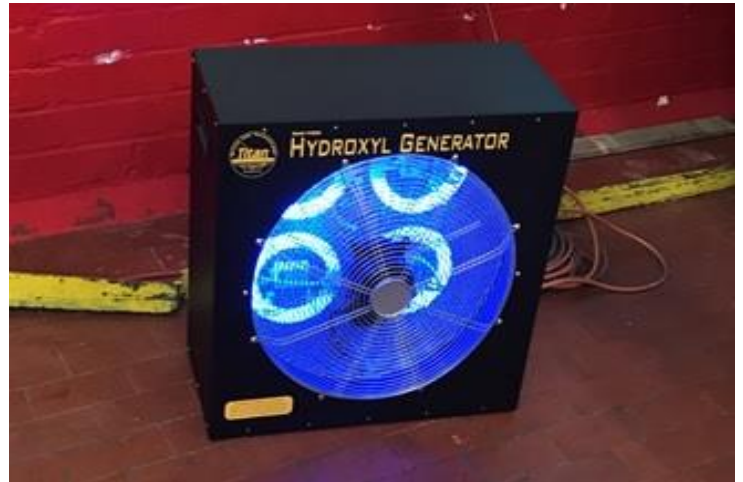
HEPA Air Scrubbing & Hydroxyl Odor Control